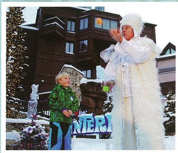
Cookie Time, Old Man Winter and a festive lighted plaza greet visitors during the winter season.