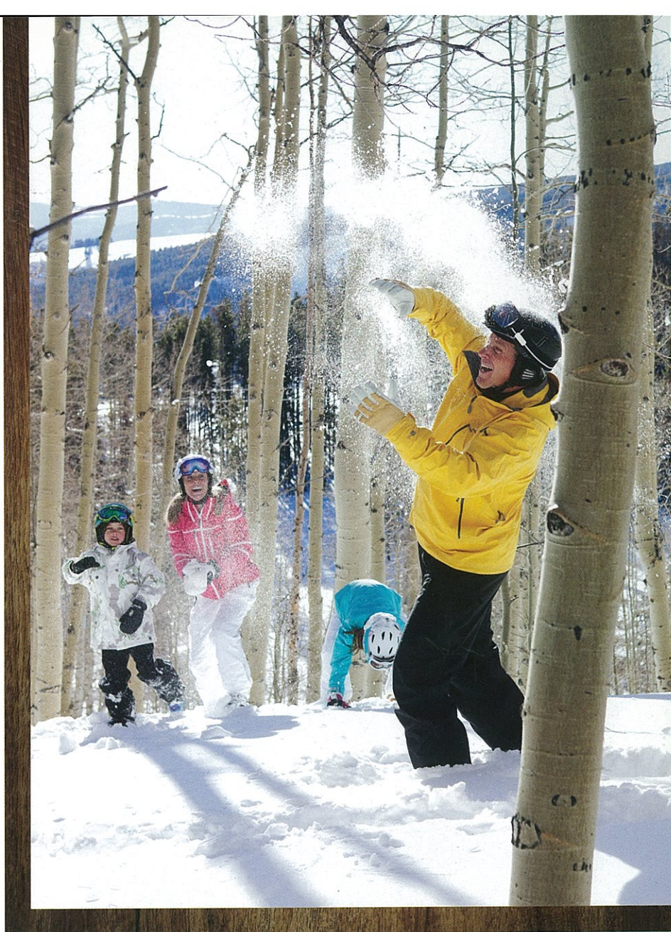
Snowball fights in aspen glades and tubing runs down Haymaker Hill turn a vacation into an adventure.

Every December, the creatures of Winterlund crawl through a portal, which leads from their underground habitat straight to Beaver Creek's village. Throughout the holiday season, characters like Old Man Winter help kids' dreams come true as they tie a ribbon to his