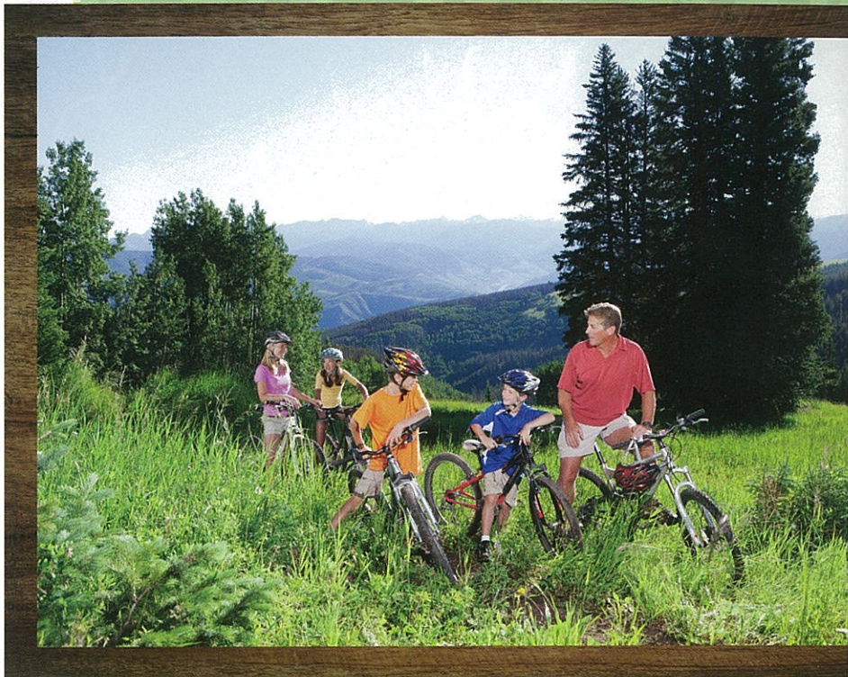
Family activities such as biking and face painting are frequent activities during the summertime.

Hall also runs the children's museum, located across from the Coyote Café that showcases about a dozen exhibits geared toward toddlers, up to age 14. In Toddler Town, youngsters build with blocks, while Kidstruction Zone for older kids offers pieces like Legos. Additionally, the Banana Jones Jungle Laboratory teaches kids about the environment with samples