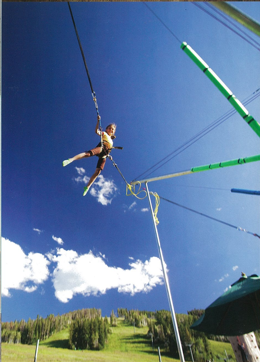
An adventure center at the base of Centennial lift includes a bungee trampoline and mini golf, as well as a climbing wall.